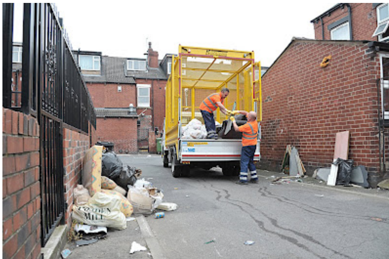
This is a back street in Beeston Hill.

Dewsbury Road is an area of special concern with a total of 31 late night takeaways operating from this busy area of Beeston. Not all the takeaways are licensed for the sale of hot food after 11pm and most are not controlled by conditions relating to litter nuisance. This has led to this area becoming of concern on the grounds of public nuisance caused by the amount of litter accumulations in the area.